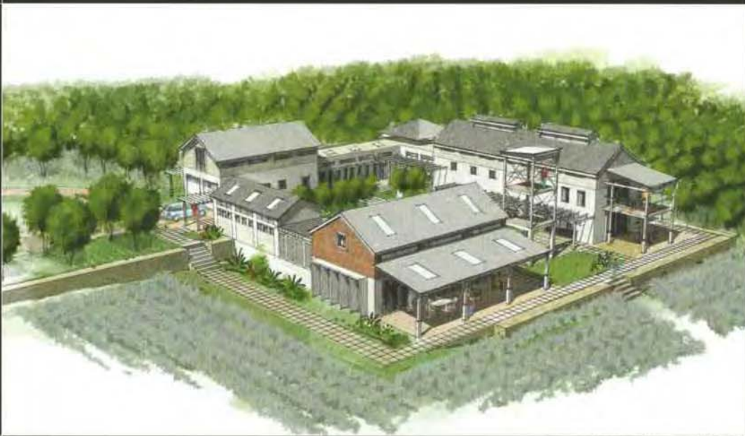
geelhoutboom - orchard house