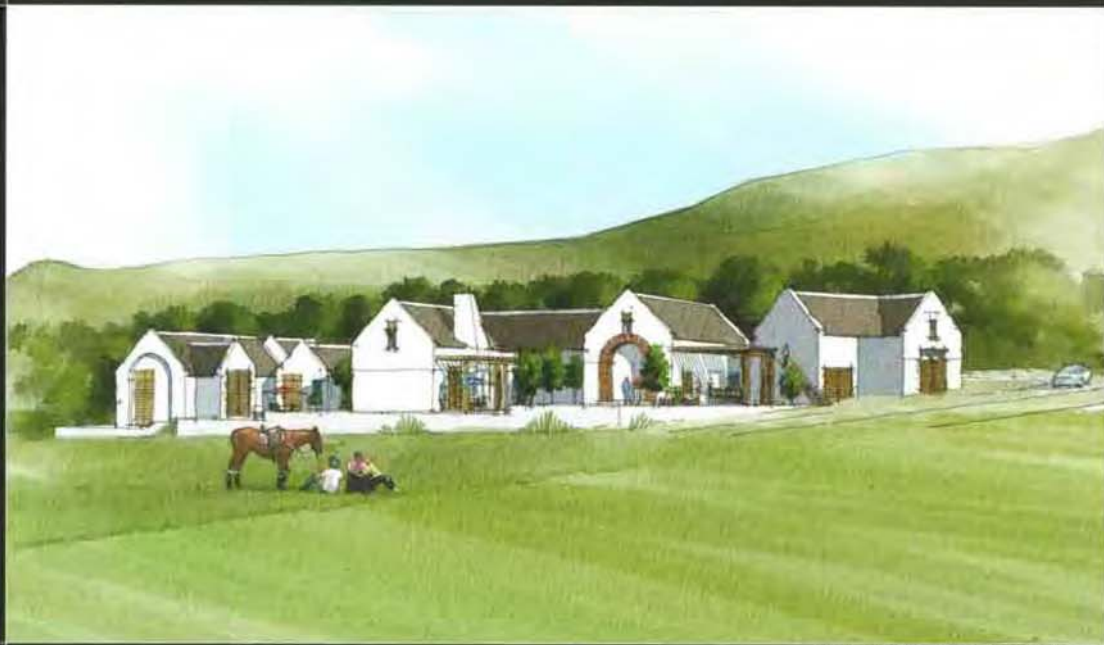
kurland polo estate and agri village