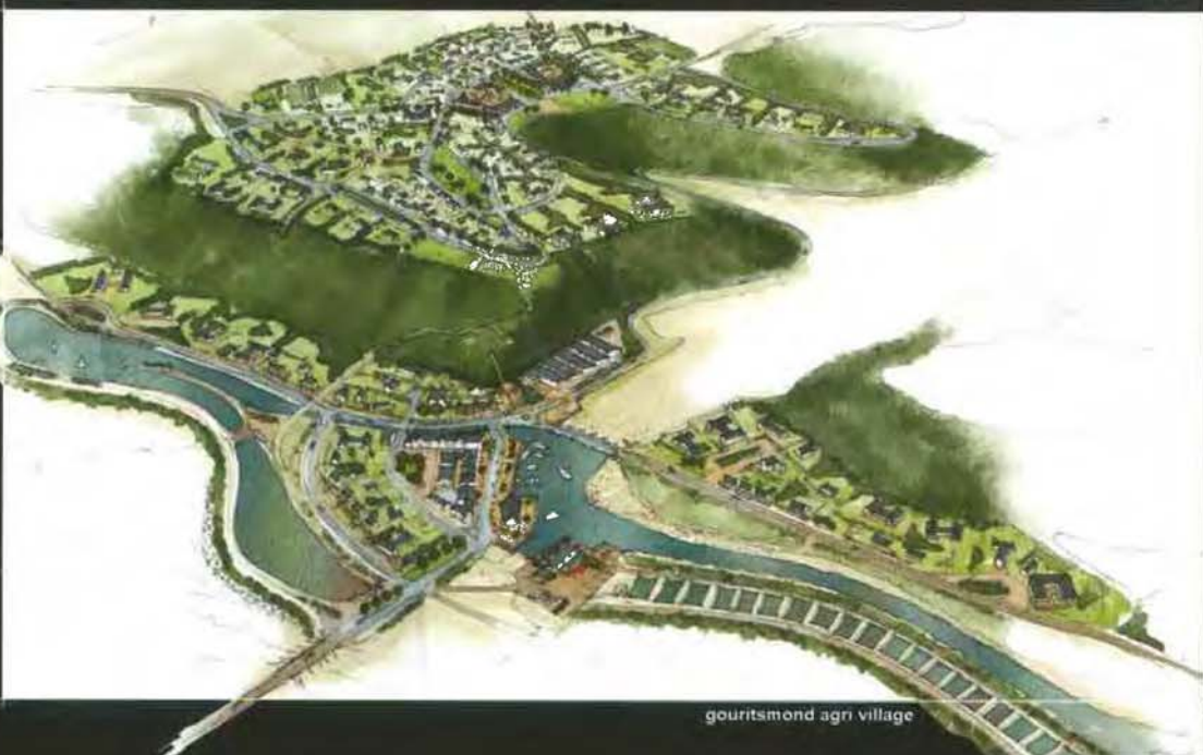
gouritsmond agri village