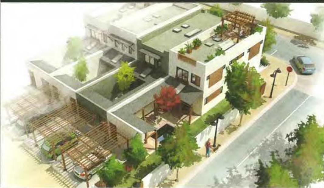
george rex - courtyard house