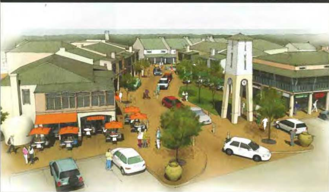
hemel en aarde village

CMAI provides comprehensive skills to ensure the successful creation, design and fulfilment of challenging commissions in the built environment.